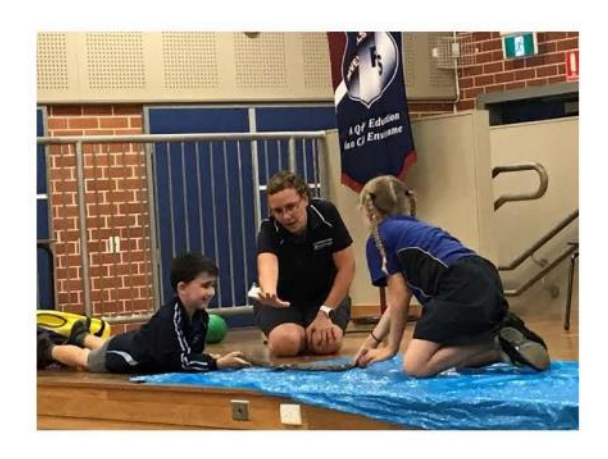
Students learnt valuable tips on how to rescue someone without getting into the water.