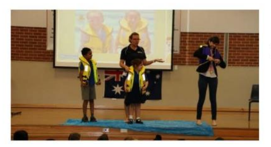
How to put on a life jacket