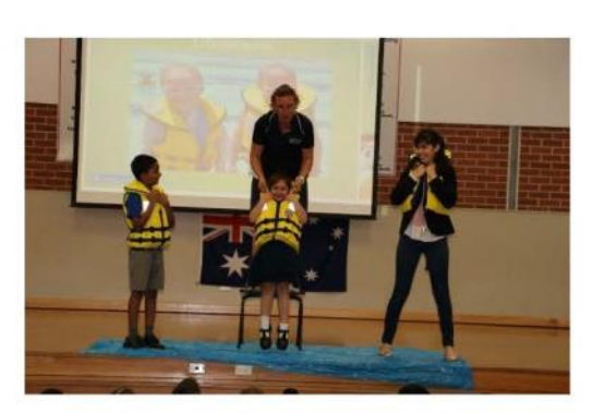
What to do if the life jacket is too big