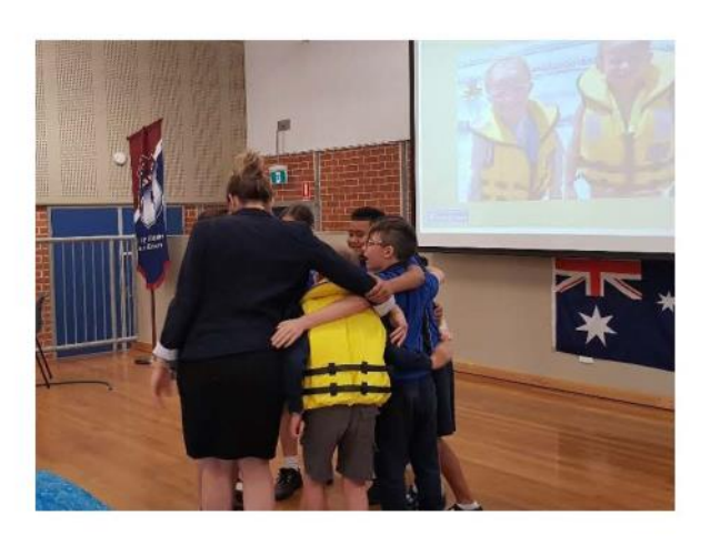
What to do if there are not enough life jackets to keep everyone safe