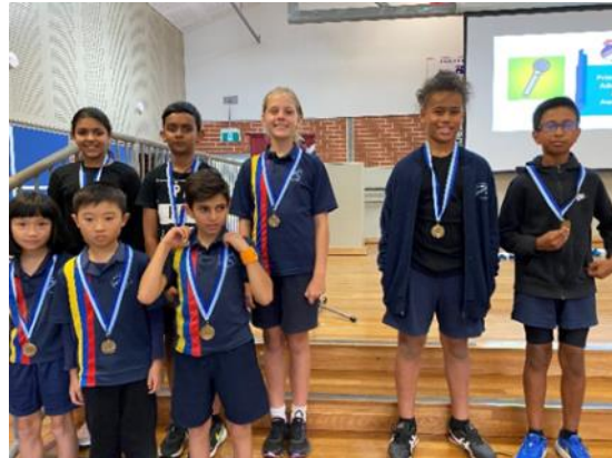
Principal Medallion winners