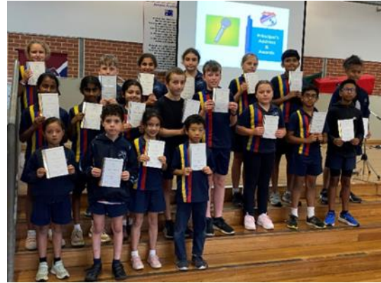
Gold and Silver Award winners

Our K-6 assemblies returned last week for the first time in over a year! We were also pleased to be able to invite parents back to watch our assembly and share in the success of those students receiving awards. Students from 5/6 Morganite presented an engaging item on topics they have been learning in class. A huge congratulations to all our students for their exceptional behaviour as an audience, but particularly to those students in Kindergarten for whom this was their first whole-school assembly. We look forward to our next assembly to be held in Week 6 (Friday 28 May). A reminder that parents who attend the assembly are required to complete the Service NSW COVID QR code sign in and sign the school sign-in sheet, located at the office, where they acknowledge that they will comply with the COVID-19 requirements for visitors, contractors and service providers each time they visit.