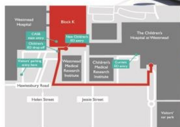
Walking route from our current Hospital to the new building

Parking is available underneath the building, as well as a 15 minute drop-off and pick-up zone, located outside the front doors.