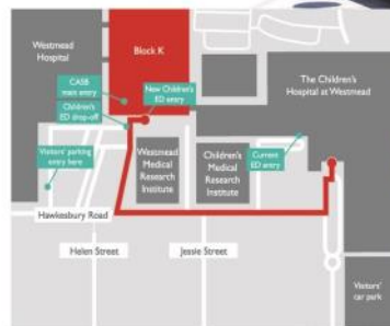
Walking route from our current Hospital to the new building.

Parking is available underneath the building, as well as a 15 minute drop-off and pick-up zone, located outside the front doors.