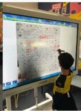
Whole Class Editing